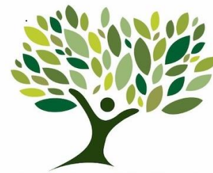
Brain Health Centre

The Oxford Brain Health Centre is going from strength to strength in spite of the challenges presented by opening and operating during the pandemic. The centre integrates research into clinical services to improve the diagnosis and management of mental health disorders in a way that can rapidly be implemented to provide improved care for patients. Since it opened more than 90% of those attending have agreed to take part in research, whether by joining the centre’s research database or completing additional assessments during their visit. This massively exceeds the 10% participation goal set by the Prime Minister in his 2020 dementia challenge. The centre has achieved high levels of patient attendance, and feedback has been overwhelmingly positive, with attendees remarking on how staff made them feel at ease, that the experience was ‘much better than expected’ and saying that their appointment was ‘really helpful and good for self-confidence’. Read the full story here .